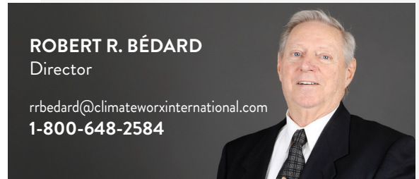
ROBERT R. BÉDARD

The unit can be positioned against an outside wall for intake and discharge of condenser air through a grill.